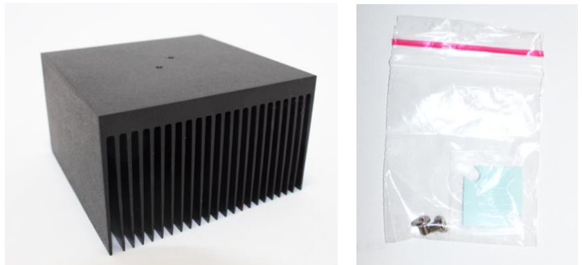
Heatsink (x1), Mounting Screws (x2), Thermal Pad (x2)