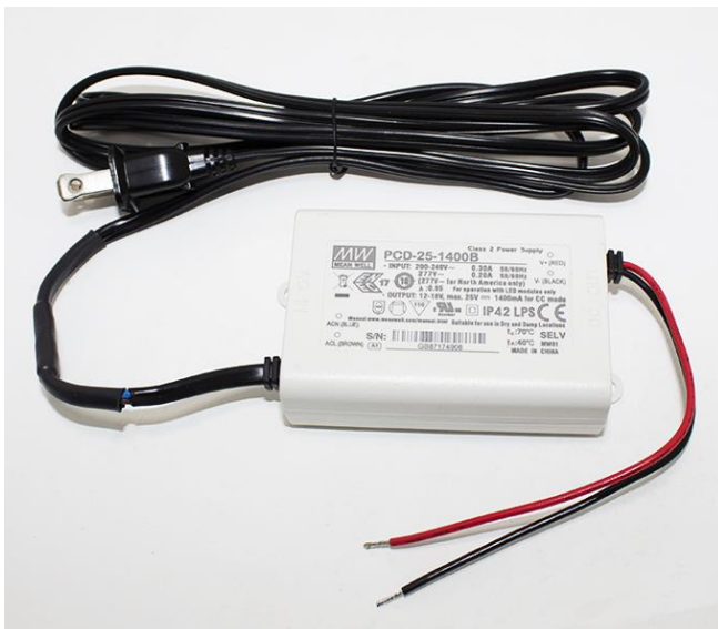
Violumas Driver Kit with LED Wire & Connector - 110V or 220V