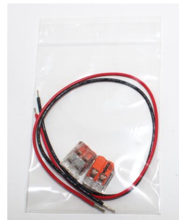
Negative/Black Wire (x1), Positive/Red Wire (x1), 2-Terminal Connectors (x2)

Photos are provided for reference only and may not be accurate of the exact items received.